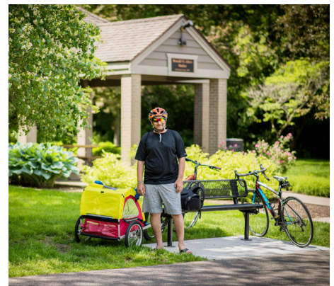
Constitution Trail

There will also be the availability to sign participants and other family members up for demonstrations by