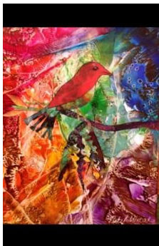
Natalie Wetzel, Whispers of Spring. ©2016.