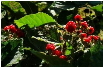
Erin Jensen, Food Forest Harvest . ©2016.

Town of Normal Vision 2040 Committee members identify two principles that cannot be separated from any of the eight proposed Core Values: Sustainability and Technology. By calling these “frameworks,” our team has opted to position both as indivisible from any action that will take us to the Town we envision in the future.