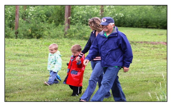
Despite overcast skies and windy weather, numerous families took advantage of the opportunity to walk the grounds and enjoy the natural trails at Sugar Grove Nature Center during National Trails Day.

Despite cool and windy weather, approximately 200 people attended National Trails Day festivities at Sugar Grove Nature Center in Funks Grove on Sat., June 1. National Trails Day is celebrated nationwide with events in all fifty states. The day was organized with assistance from the Illinois Grand Prairie Master Naturalists.