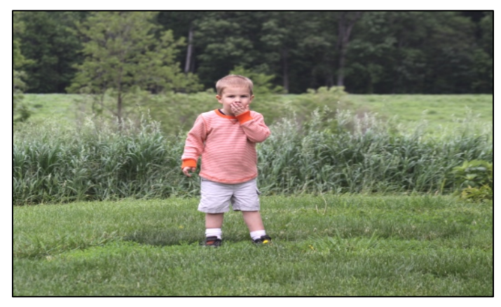
A budding future naturalist appears to be surprised by something in the woods during his walk on National Trails Day at Sugar Grove Nature Center.

Activities included guided hikes throughout the preserve's over seven miles of trails. Several informational booths featuring conservation information and children's activities were also highlighted.